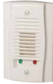
APA151 UL S4011