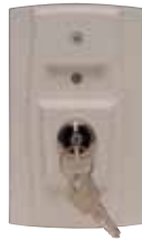
RTS151KEY UL S2522