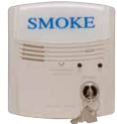
RTS2-AOS UL S2522