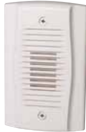
MHW UL S4011