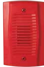
MHR UL S4011