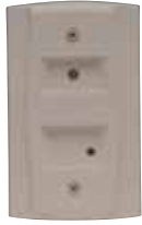
RTS151 UL S4011

System Sensor provides system flexibility with a variety of accessories, including two remote test stations and several different means of visible and audible system annunciation. As with our duct smoke detectors, all duct smoke detector accessories are UL listed.